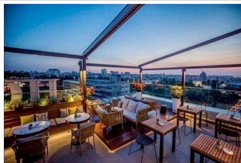
Heritage Rooftop - Open air gastro bar